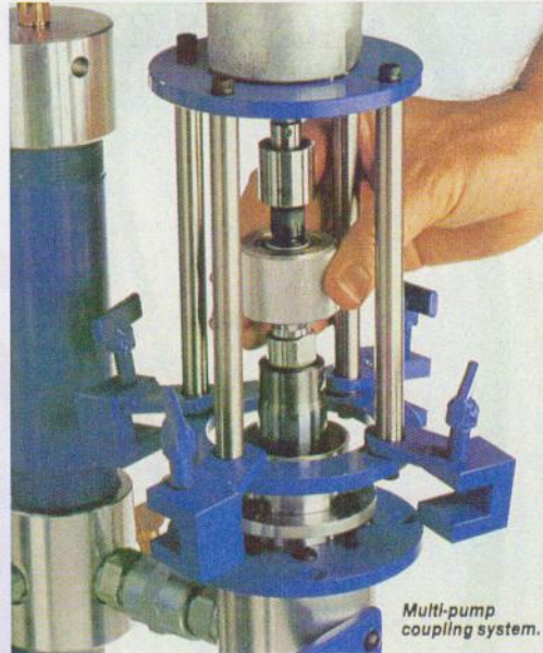
Multi-pump coupling system.

The Robinson Airmix Unit features external mix and the catalyst flowmeter system to provide the operator with the most cost effective spray up method available. Our many years of experience prove that a simple design and fewer moving parts ensures a much lower operational cost. Robinson's Airmix generation of external mix spray equipment will reduce maintenance costs and extend service intervals.